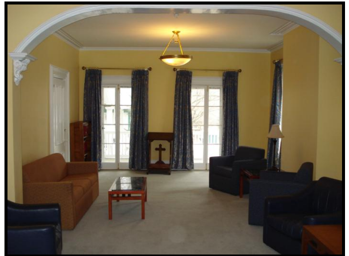
Newly renovated Kirkwood Room @ Manor House